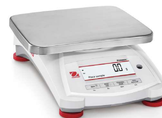
PX12001 and PX12001/E model

Four quick keys enable easy operation of multiple weighing modes.