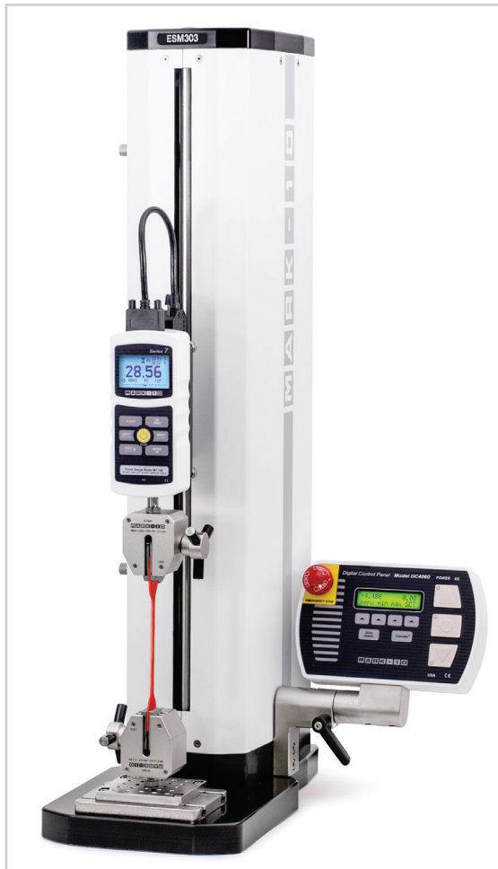
^ ESM303 is shown above configured for a tensile test, with a Series 7 force gauge and G1061-2 wedge grips.

The ESM303 is a highly configurable single-column force tester for tension and compression measurement applications up to 300 lbf [1.5 kN], with a rugged design suitable for laboratory and production environments. Sample setup and fine positioning are a breeze with available FollowMe™ force-based positioning - using your hand as your guide, push and pull on the force gauge or load cell to move the crosshead at a variable rate of speed.