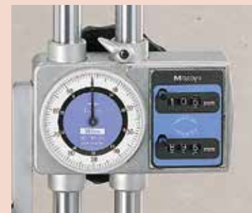
Easy and error-free reading