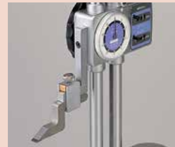
Easy and secure clamping