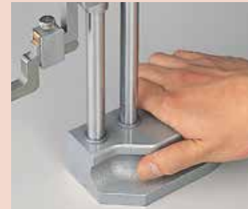
Comfortable grip base