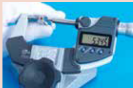
Tip angle: 15° (R0.3mm)