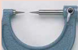
Tip angle: 30° (R0.3mm)